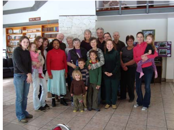
Group Photo from the Inonoaklin Edgewood Broadband Phase 2 Completion Celebration.