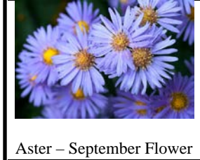
Aster – September Flower

The Edge Hours of Operation Tues, Thurs - Fri. 10:00 AM – 2:00 PM Please contact The Edge to update your information or to place/remove your advertising